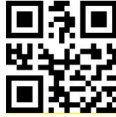
CR LF CR